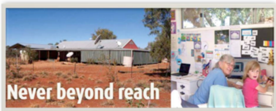
This photograph is the property of the Uniting Church Frontier Services and appeared in one of their quarterly Newsletters. It is used here acknowledging the work of Frontier Services.